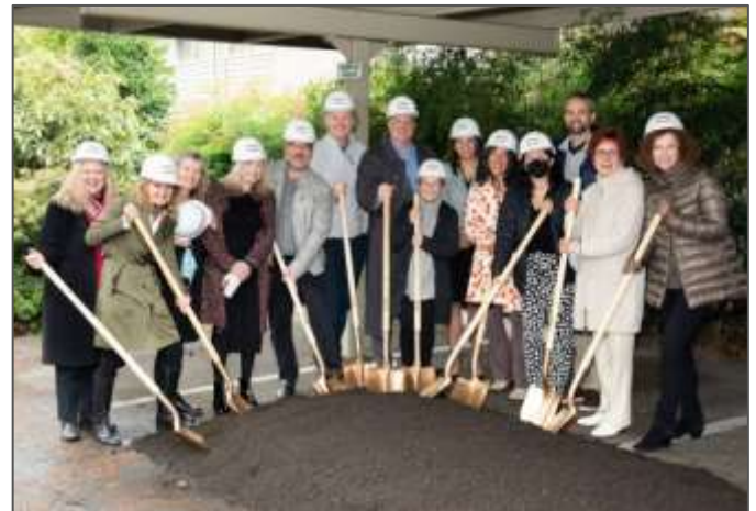
Groundbreaking for LifeWire, a development that received funding through the Housing Stability Program.

More than just a single project, Bellevue's Housing Stability Program (HSP) is a dedicated taxation program developed to generate capital for projects that serve the city's most vulnerable residents. The HSP provides funding for construction, acquisition, operation, maintenance and on-site support services. Using the .1 percent tax option, the HSP has provided $16 million in project funding over the last two years for construction and preservation, serving households earning 30 percent or less of AMI. The HSP supports Bellevue's strategic housing goals under their existing comprehensive plan and their 2017 Affordable Housing Strategy.